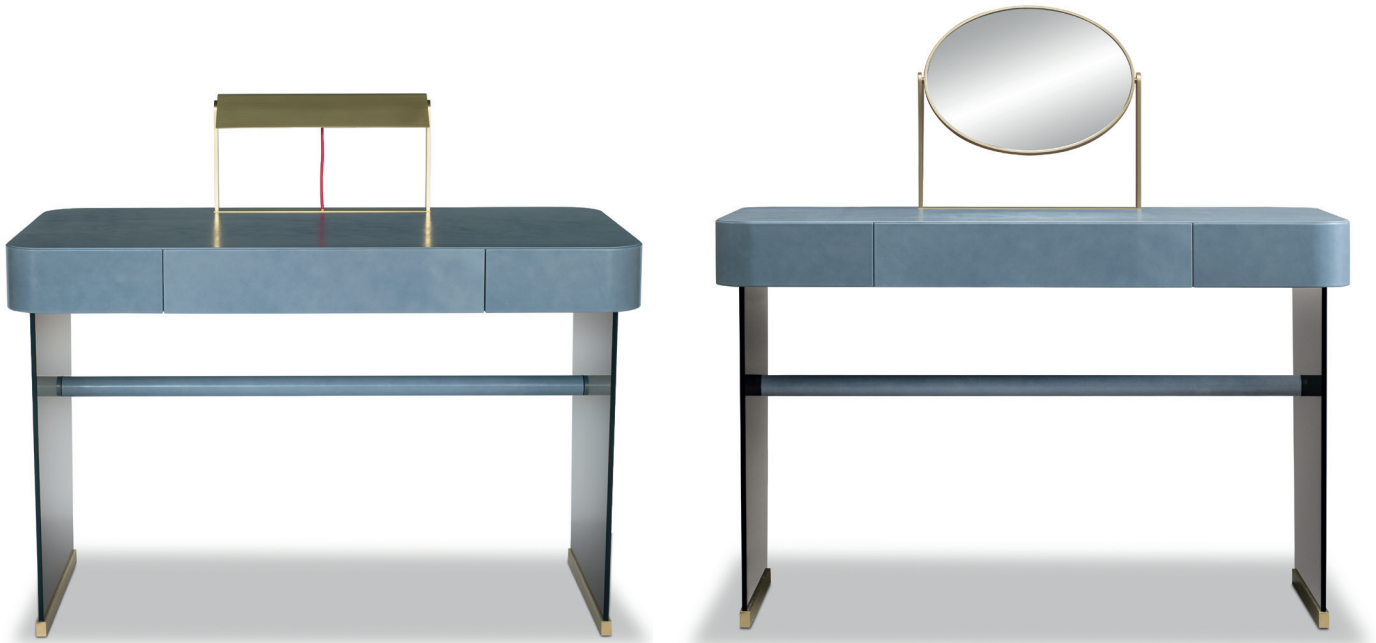
Tuscany Punta Ala

Base in vetro temperato colorato bronzo in pasta, spessore 10 mm, con profili terminali in ottone satinato. Barra di collegamento in alluminio, diametro 40 mm, rivestita in pelle e completa di borchie terminali in ottone satinato. Struttura in MDF con rivestimento in pelle con cassetto impiallacciato in palissandro India.