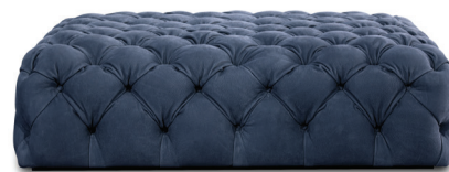
120 x 120 | Kashmir Saphir

Modello trapuntato a capitonné. Struttura in multistrato di abete. Telaio sedile in abete. Base in faggio tinto wengé. Imbottitura in poliuretano espanso a densità differenziata con rivestimento in fibra acrilica. Molleggio a nastri elastici intrecciati di caucciù rivestito. Lavorazione capitonné eseguita a mano.