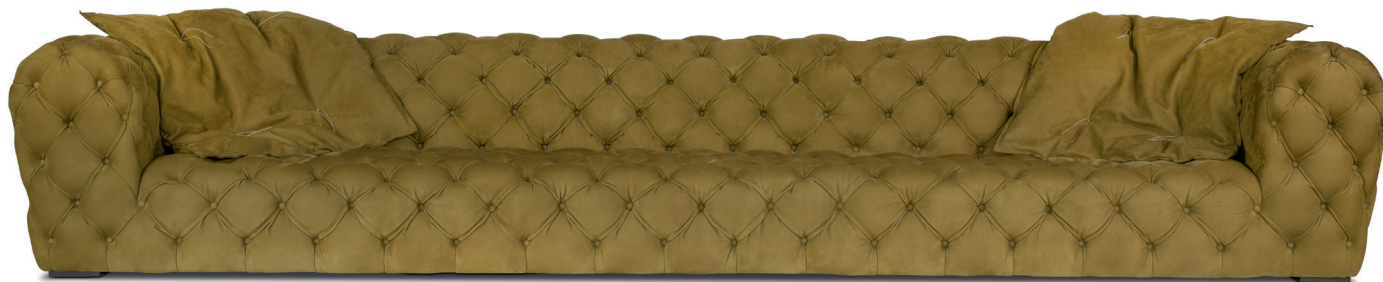
395 x 107 | c. Hard & Soft Slim 80 x 80 | Nabuck Kiwi